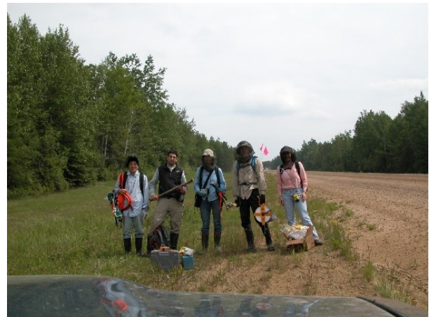
Fig. 4. Professor Moghaddam during a fieldwork trip in the boreal forests in Canada.

A6: You serve as a role model for younger students and aspiring professionals, inspiring them to pursue similar paths. How do you perceive yourself in this role? Have you encountered students who express admiration and a desire to emulate your achievements?