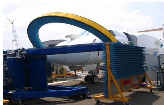
Fig. 3. Microwave Vision Group StarBot system.

The last focus area is related to in-situ measurements. Figure 3 shows the multiprobe StarBot system designed by MVG for the measurement of on-board antennas in airplanes. Figure 4 shows the Portable Antenna Measurement System (PAMS) that takes the form of a gondola suspended from the existing cranes. Astrium GmbH has built it, with support from ESA's Advanced Research in the Telecommunication Systems (ARTES) programme [11]. In Fig. 4, PAMS is shown performing near-field probing along a tilted and planar-oriented scan surface. This solution, together post-processing tools, is very convenient for the measurement of satellite antennas. It is also remarkable the work of some researchers from Politecnico de Torino. They designed an antenna test system using a flying hexacopter equipped with RF transmitter and a telescopic dipole [12]. All these solutions simplify the measurement process, making it closer to the design laboratory or to the final placement of the antenna.