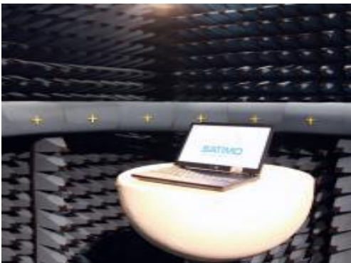
Fig. 2. Microwave Vision Group System to measure small antennas on terminals.

Multiprobe technology was proposed in [8] using the Modulated Scattering Measurement Technique (MST). This technique allows the identification of the signal coming from each antenna probe through a different orthogonal low frequency code. Therefore, a passive combiner network can be used, and each individual probe signal in amplitude and phase can be recovered. Of course, this technology can be used for the implementation of classical near field systems (spherical, cylindrical or planar) replacing one of the axes by a multiprobe system. The main advantage of these systems is the reduction of time, since only one dimension scan is required.