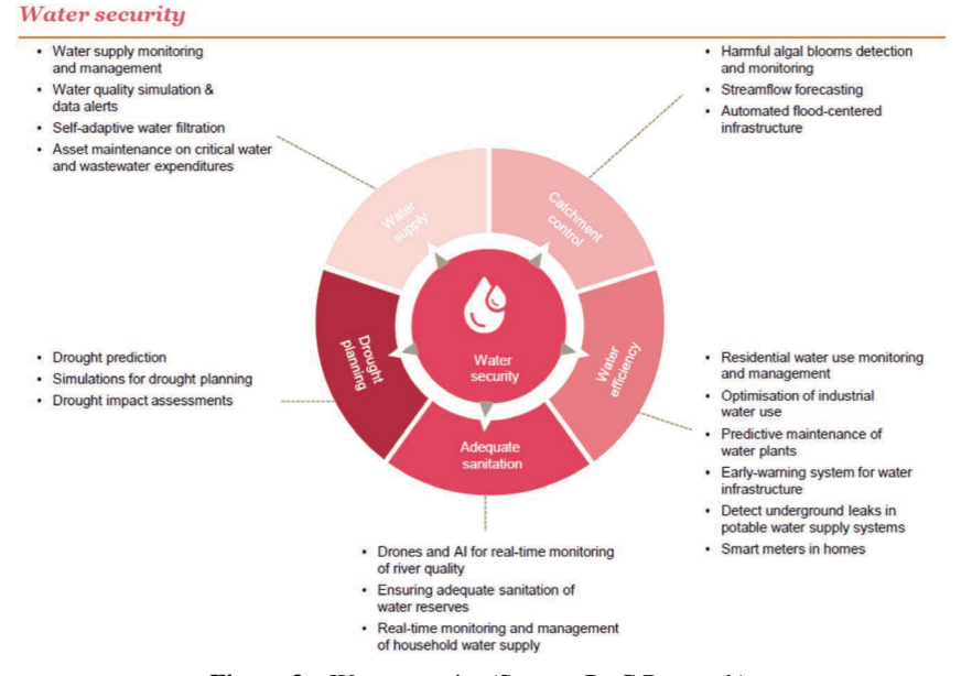
Figure 3 Water security.

world's water resources. AI, IoT sensors and Big Data analytics can provide efficiencies via automation and remote monitoring in not just agriculture but also the monitoring of sewerage networks, so waste is properly disposed of. Emerging technologies in the context of SDG 6 provide water and sanitation equitably to everyone on the planet.