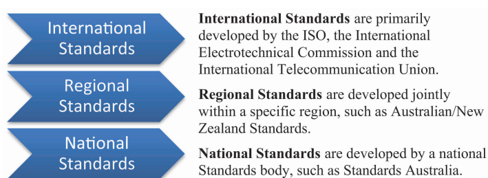
Figure 1 The Standards Hierarchy.

Importantly, Standards are required to respond effectively to global regulatory requirements, market needs and technical developments. While guidance has been provided, such as through the United Kingdom's Cryptoassets Taskforce Final Report and the Australian Taxation Office's GST Rulings, the scope of work being undertaken by the Working Group and its Research Team is novel as it is the first internationally coordinated standardisation of blockchain and DLT.