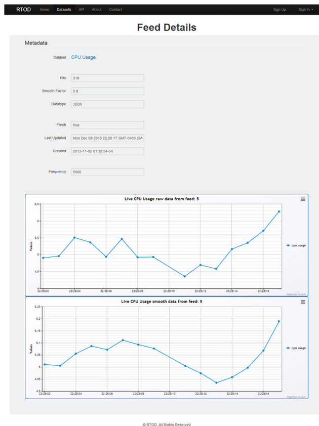
Figure 3 Sample use case

Figure 3 provides a simple application for displaying the retrieved data (i.e. the CPU utilization of the data source) on the client (the data consumer).