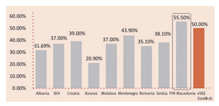
Figure 3 Internet penetration in SEE [22].

The ICT responsibilities in the country were centralized through the creation of a Ministry for Information Society and Administration (MIOA) [23] that closely monitors all ICT related developments including the standardization and the SE. Also, MIOA is responsible for implementation of governmental ICT politics, thus contributing to the achievement of all objectives in the