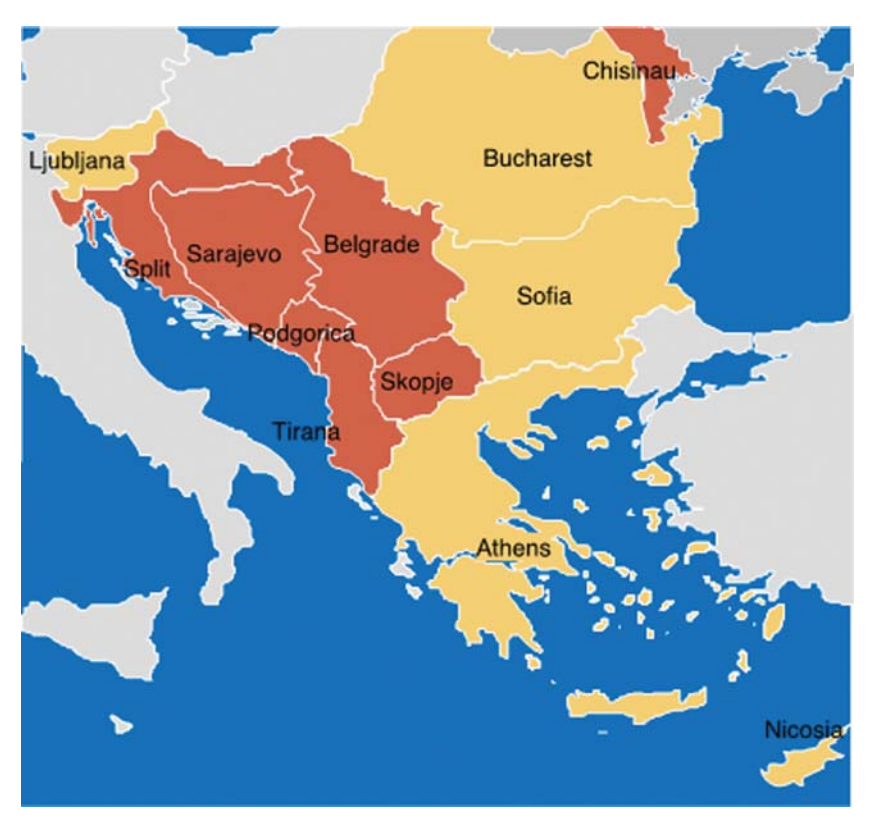
Figure 2 Geographic focus of the INA Academy (red colour indicates associated EU country, yellow colour indicates EU country member) [5].

coverage including remote areas. Macedonian schools offer one web-enabled computer for every 1.45 children. University students and academics can freely access knowledge and research resources via the academic network MARnet.