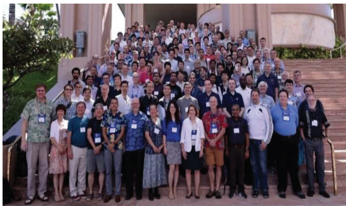
Figure 2 Participants to a face to face meeting of the IEEE 802.11 working group, before the COVID-19 breakout.

at 2.4 GHz, 5 GHz, and 6 GHz. Wi-Fi 6E (E stands for ‘Extended’) is the label given to products capable of making use of the 6 GHz spectrum band.