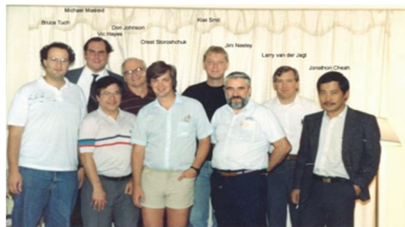
Figure 1 Start of the IEEE 802.11 working group (courtesy of IEEE).

As of 2022, the latest commercially available release of Wi-Fi is based on so called IEEE 802.11ax or 802.11ax-2021 specifications, and is branded as Wi-Fi 6 by the Wi-Fi Alliance, operating in license-exempt frequency bands