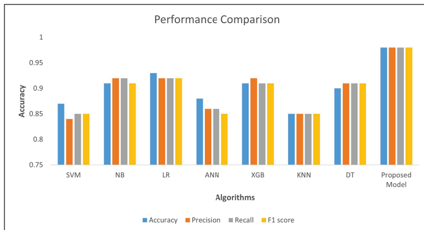
Figure 2 Comparison of proposed model with state of art models.

(ANN), XGBoost (XGB), K Nearest Neighbors (KNN) and Decision Tree (DT). The results depicted in Figure 2 show that our proposed hybrid model (BPNN+SAGBPSO+CSA) performed exceptionally well as compared to the current models for the benchmark dataset too.