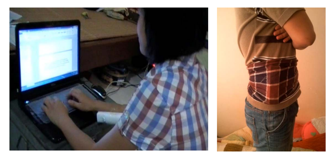
Figure 1. Wii Remote worn on wrist (left) and Wii Remote worn on hip (right)