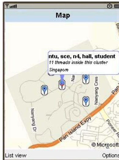
Figure 6. Clustered search results.