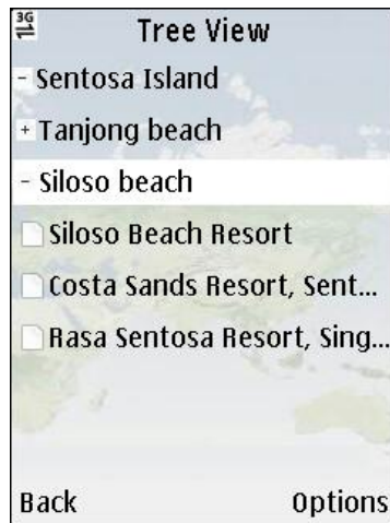
Figure 4. Hierarchical structures of annotations in tree visualization