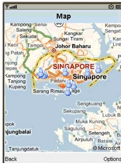
Figure 3. Annotations on a map-based visualization